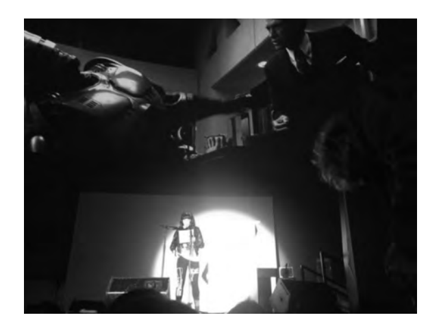
The Cybernetic Cop: RoboCop and the Future of Policing

This essay is an adaptation of a multimedia performance originally conceived for the L.A. Filmforum's Cinema Cabaret (curated by Konrad Steiner). It was also performed at MoMA PS1 at The Return of Schizo-Culture on the occasion of the fortieth anniversary of Semiotext(e). A video version of the performance was produced for the Whitney Museum of Art's S/N exhibition at The Kitchen, with assistance from curator Alexander Fleming. The video can be viewed at: https://youtu.be/bUbQh8HegLU.